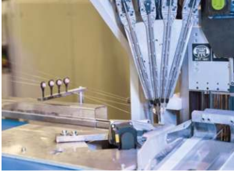
Weft yarn insertion left