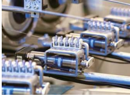
Controlled insertion system ETM/ETC