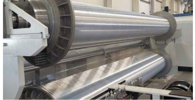
Sectional warped beams