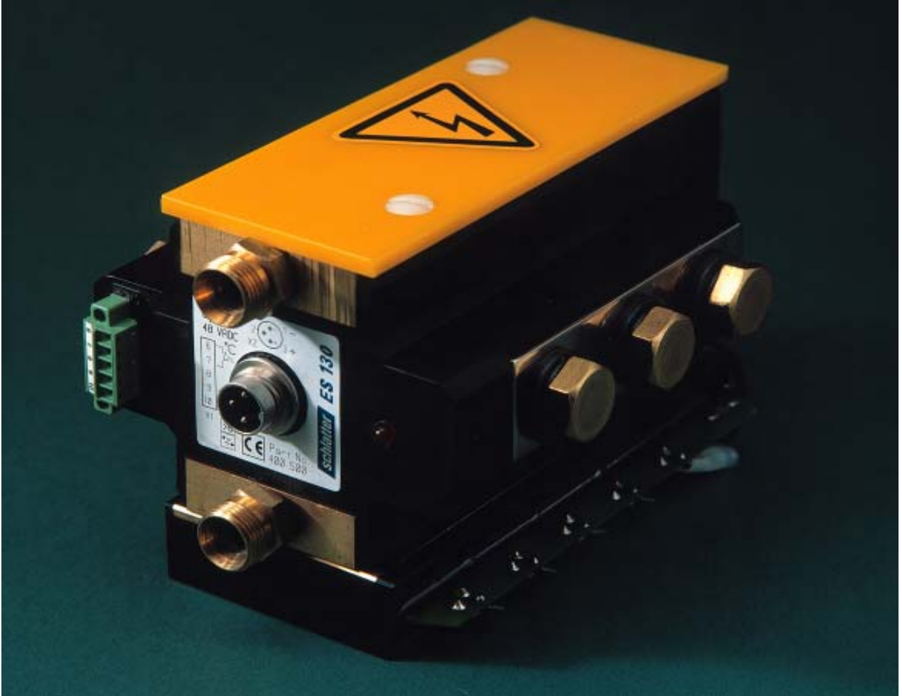
Power Stage ES 130 with mounted base load