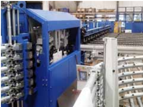
Straightening and cutting machine MRM

The straightening and cutting speed of the longitudinal wires is greatly increased and adapted to the cross wires due to the multiple straightening and cutting machine (MRM). This increases the productivity of the machine MG800.