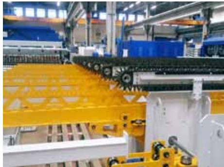
Chain transfer for the line wires